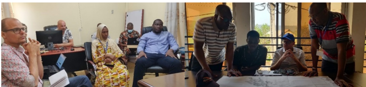
Preparing the presentation for SOMAGEP management