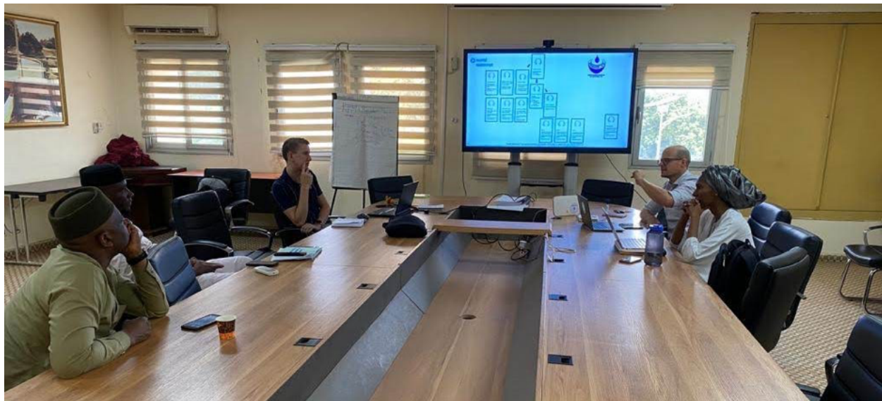
Discussing the organogram of WWx coordination team

Another challenge mentioned was that it was unclear to the mentee what budget was available for the different activities. According to the mentee, it would have been helpful for the teams to know what the available budget for each activity was. It is their wish that in future, there is a clearer understanding of the budget.