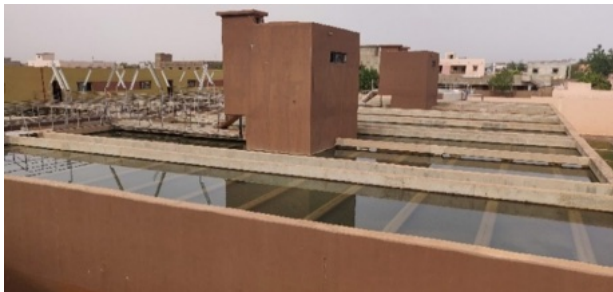
The Kalaba installation

Before the WOP, some of the Dutch experts had lived in Mali for 2 years working on the Laboratory certification project. They were supporting Quality improvement of the laboratory processes. When the WOP started, the team continued to work. The Malian team that has been in the WOP are the same people the Dutch team worked with earlier. Trust has therefore been growing for a long time as not so many changes have been made to the team. This composition of project coordinators, project leaders, short-term experts and the local teams is what steered the WOP to success.