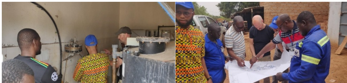
Inspecting water installation

The WOP started with a diagnosis visit from experts from World Waternet, who explained the WaterWorx program, the objectives, and the mechanism of collaboration between the mentor and the mentee. All directors participated in the meeting. The experts then had one on one meetings with the directors. A lot of direct discussions were conducted with the utility's Managing Director (MD). The MD and deputy MD were intensely involved in the design of the project. In a meeting with the deputy MD, the design of the program was agreed. The general format was presented to the rest of the utility team to discuss how the proposed content fit the needs of the utility. The process of needs diagnosis was participatory however the first design was with the experts and the deputy MD.