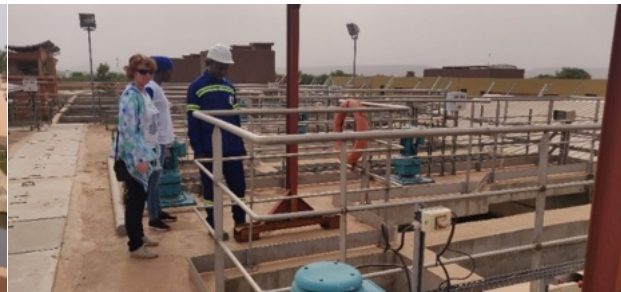
Taking a tour around Kalaba